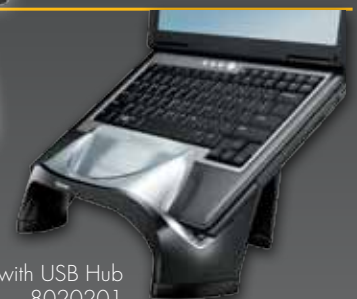
Smart Suites™ Laptop Riser with USB Hub 8020201