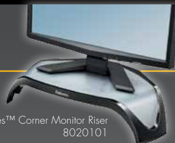
Smart Suites™ Corner Monitor Riser 8020101